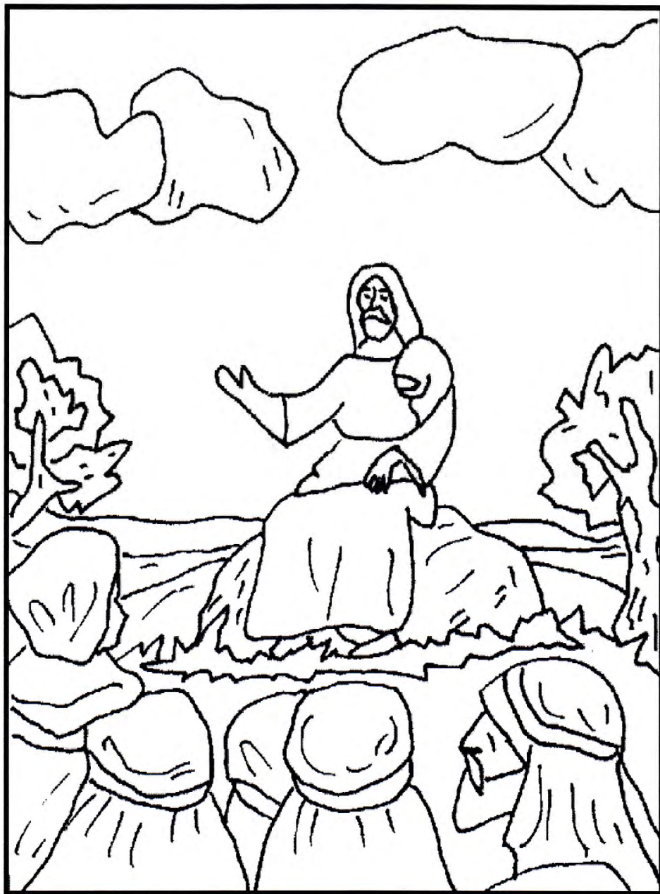
The Sermon on the Plain Luke 6:17-26