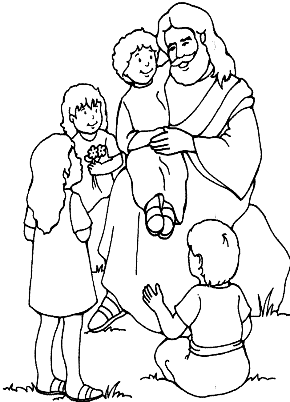
Jesus and the Children